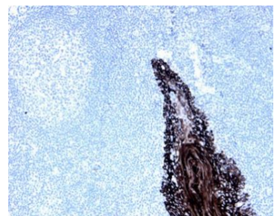
Tonsil section has been stained using CK17 antibody (Clone: BS55) with 1:200 dilution. Epithelia of tonsil are stained intensively.